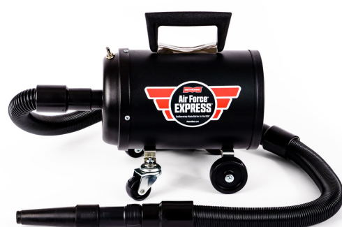
AF-EXPRESS-25: AIR FORCE EXPRESS 25