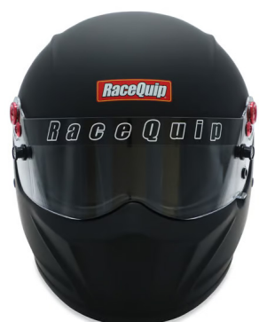
RACEQUIP VESTA20 FULL FACE HELMET