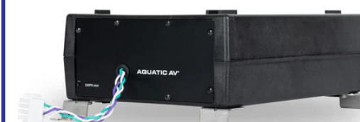
SWA6MINI: AMPLIFIED COMPACT SUBWOOFER