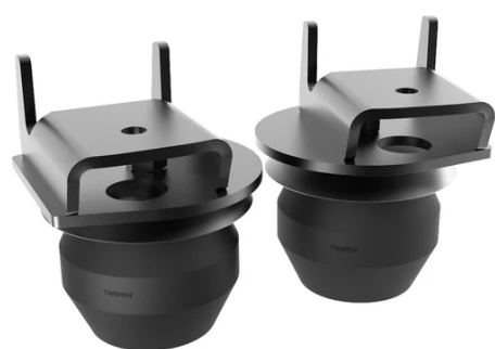
ACTIVE OFF-ROAD BUMPSTOPS FOR 1ST GEN FORD SVT RAPTOR - REAR KIT