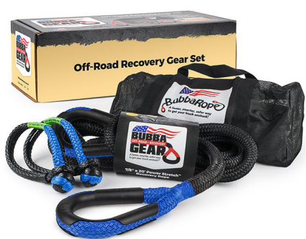
BUBBA OFF-ROAD TRUCK RECOVERY GEAR SET