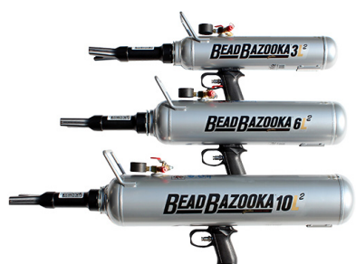
BEAD BAZOOKA® (GEN 2)