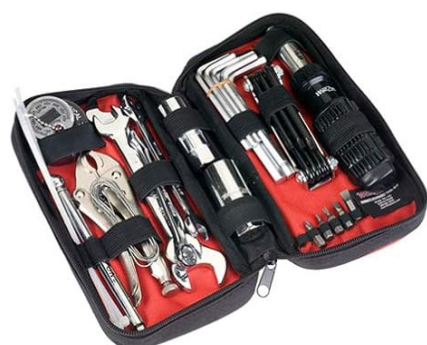
ESSENTI-ECONOMY KIT | EE-1HD | FOR HDS AND HD HYBRIDS