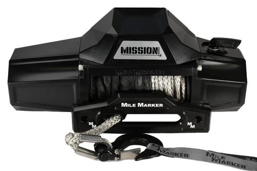
MISSION 12K CAPACITY WINCH WITH SYNTHETIC ROPE - COVERT BLACK