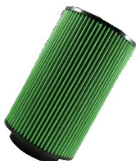
RANGER HIGH PERFORMANCE AIR FILTER