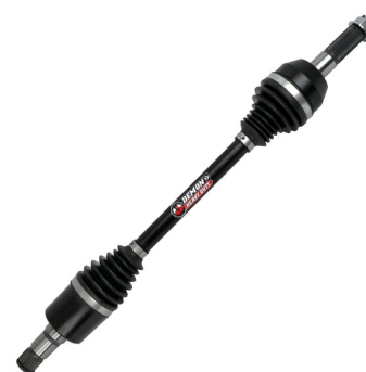
POLARIS RANGER 700 DEMON HEAVY DUTY AXLE