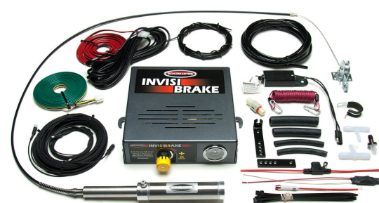
INVISIBRAKE SUPP. BRAKING SYS