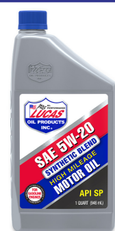
SYNTHETIC BLEND HIGH MILEAGE MOTOR OILS