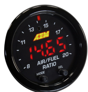
AEM X-SERIES WIDEBAND UEGO AFR GAUGE KIT