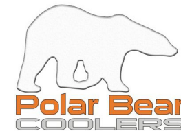
Polar Bear Coolers