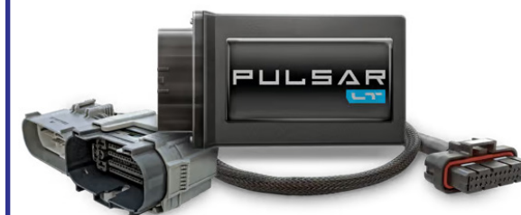
PULSAR LT FOR 2019-2022 GM GAS TRUCKS