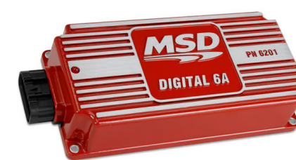
MSD DIGITAL 6A IGNITION CONTROL - RED