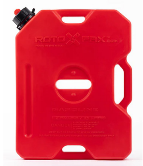
2 GALLON GEN 2 GASOLINE